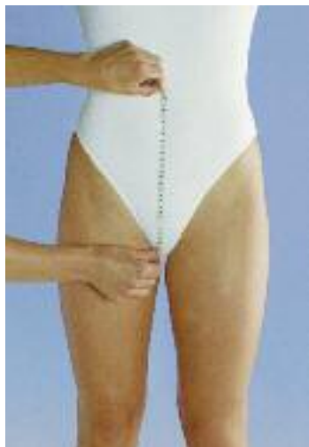
Measure the length of the panty at the front ( K1-T ) from the waist to the crotch.