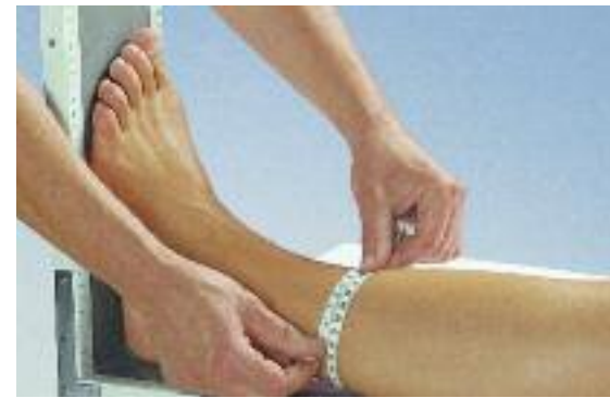
Measure circumference B1 and length a-B1 at the Achilles tendon / calf transition.