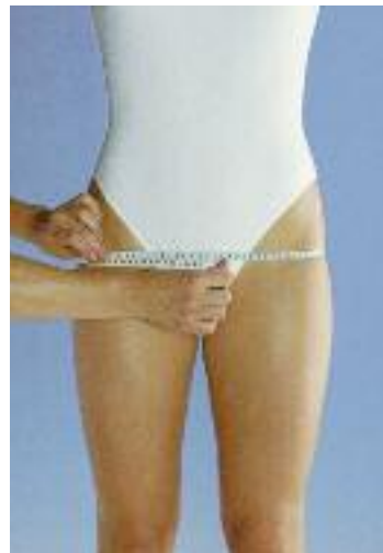
Measure circumference H at the level of the greatest circumference around the hips.