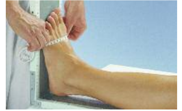
Take circumferential measurement A at the metatarsophalangeal joint.