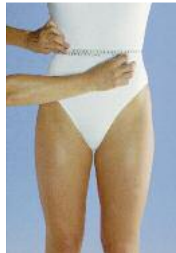
Measure circumference T at the waist.