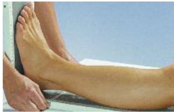
Measure circumference B and length a-B above the ankle at the narrowest point of the calf.