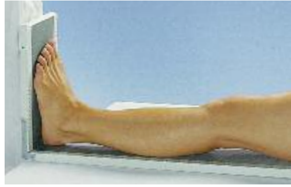
Place the measuring board on a stable surface, place the tape measure, ballpoint pen and size order card in readiness; have the patient place her leg on the measuring board.

This guide will service measurements for Elvarex ® , Elvarex ® Soft, Custom Seamless Soft and Bellavar ® lower extremity garments.