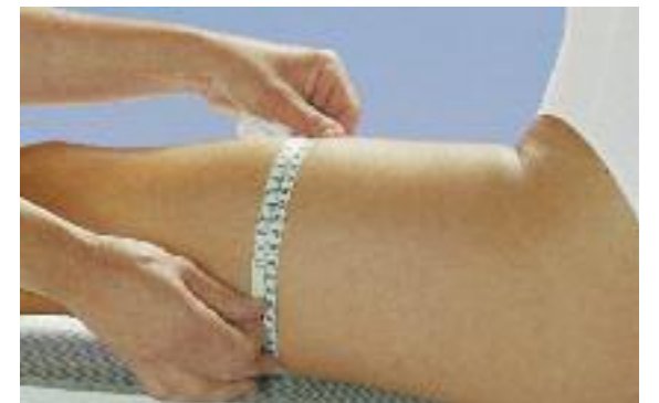
Measure circumference F and length a-F at the middle of the thigh.