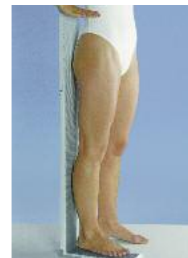
Measure length a-T on the outside as far as the waist, reading off directly from the measuring board. The customer determines the waist height herself with her hand.