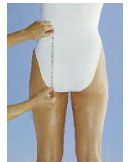
Measure the length of the panty at the back ( K2-T ) over the buttocks as far as the gluteal fold.