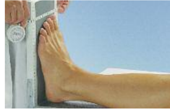
Foot length without tip: from the metatarsophalangeal joint to the end of the heel. Foot length with tip: from the tips of the toes to the end of the heel.