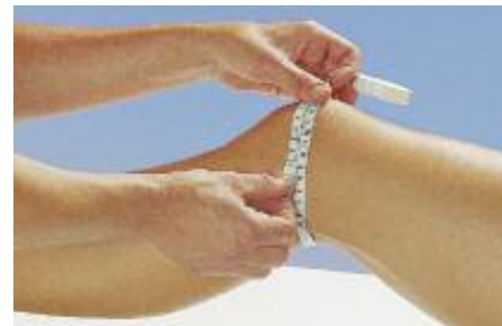
Circumference E is the knee circumference; measure at the middle of the patella, with the leg slightly angled.