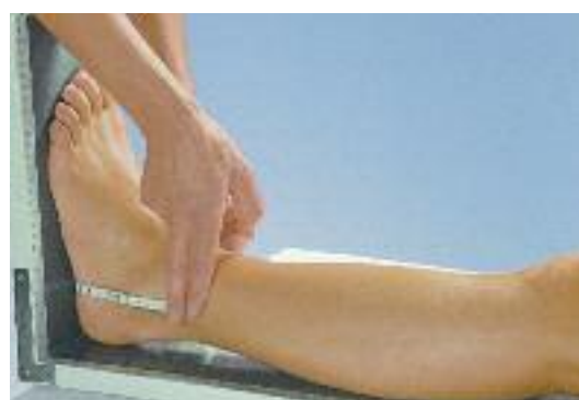
Measurement point P2 : measure from the medial malleolus over the sole of the foot to the lateral malleolus.