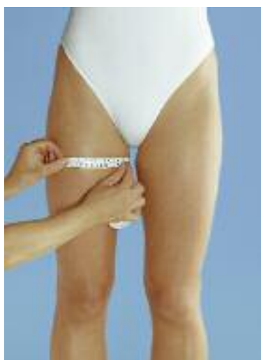
Measure circumference G at the greatest thigh circumference. Measure length a-G posteriorly from gluteal fold straight down to the floor.

For compression panty hose, also take the following measurements: