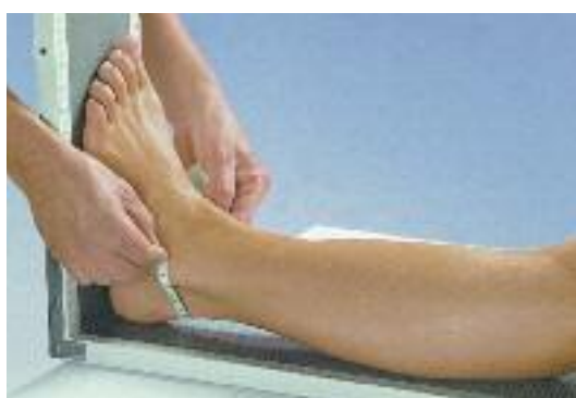
Measurement point P1 : measure from the medial malleolus over the Achilles tendon to the lateral malleolus.