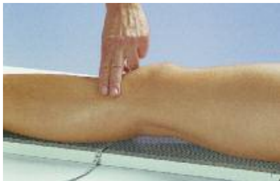
Measure circumference D and length a-D at the fibular head (two finger widths below the kneecap).