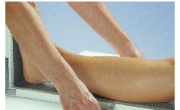
Measure circumference C and length a-C at the greatest calf circumference.