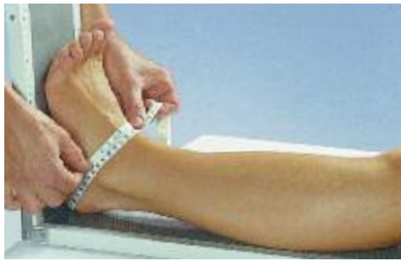
Take circumferential measurement Y around the instep and heel at maximal dorsiflexion.