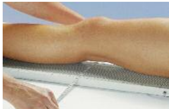
Measure length a-E to the middle of the kneecap with the leg extended.