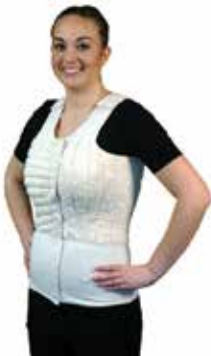
Vest with optional Full Padding (shown with vertical & horizontal padding options for illustration)

$10.00 to business addresses $13.25 to residential addresses