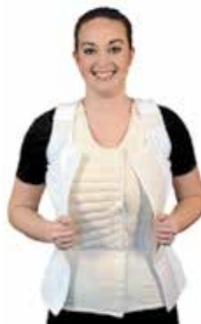
Vest with JoViJacket