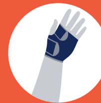
Ambidextrous Hand Gauntlet