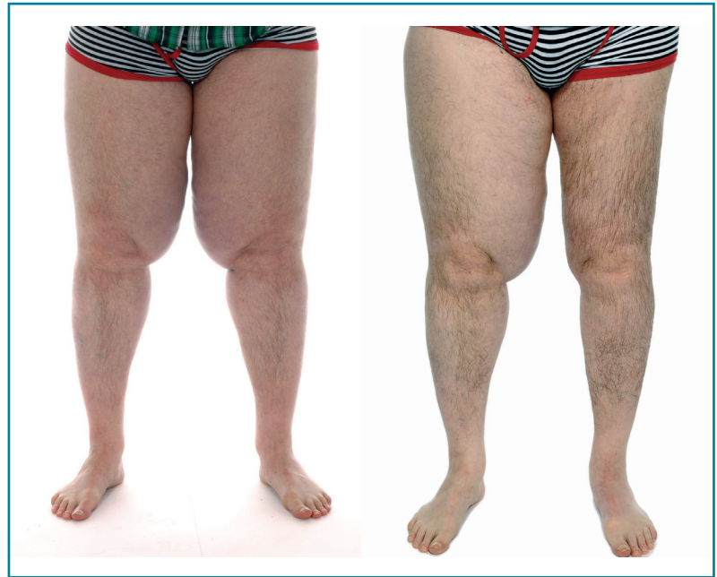
Figure 10. Neil pre- and post-operation showing reduction to left leg