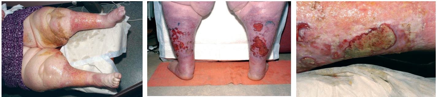
Figure 5. Mavis before treatment