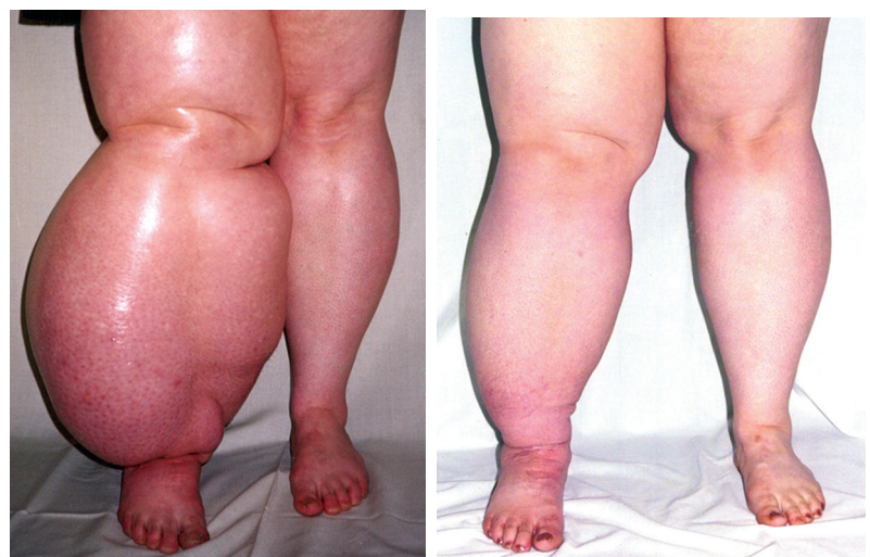
Figure 7. Sophie before and after treatment with FarrowWrap

a calf measurement of 101cm. Following three weeks of daily short-stretch multi-layer bandaging her calf had reduced to 89cm (Figure 8). Sarah received modified bandaging for a further three weeks and was then fitted with class 4 made-to-measure flat knit garment (Goldpunkt, from Haddenham Healthcare). Sarah used ongoing self-administered pneumatic compression (Hydroven 12 with LymphAssist), which is designed to mimic manual lymphatic drainage. Following six months' treatment using garments and LymphAssist, Sarah was fitted with a FarrowWrap Classic for ease of application and to continue to reduce the swelling and maintain the results. In this instance the FarrowWrap provides the strong compression required to prevent refill oedema and maintain the excellent results