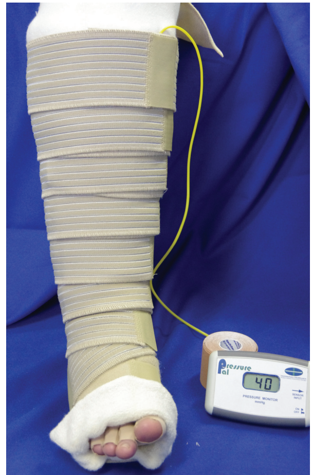
Figure 2. FarrowWrap Classic providing 40mmHg as demonstrated by PressurePal sensor

FarrowWrap is available in two types: Classic and LITE. Having two compression strengths ensures that FarrowWrap is suitable for managing differing types of lymphoedema and patient groups, including elderly, palliative and those with fragile skin (Lawrance, 2008). FarrowWrap Classic is suitable for moderate-