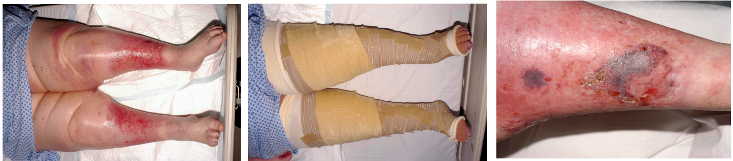
Figure 6a-c. Mavis after treatment

in addition to her class 4 garments. Sophie remains independent and wears the FarrowWrap when she feels she needs additional support, for example when working (she is a gardener), and at night instead of bandaging. She finds the FarrowWrap versatile and that it maintains the softness of the lower leg. Sophie is maintaining her leg well with this combination of garment and FarrowWrap while waiting for lymph-node transplant surgery (Figure 7).