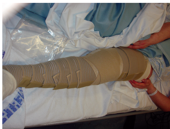
Figure 11. Neil wearing FarrowWrap immediately post-operation