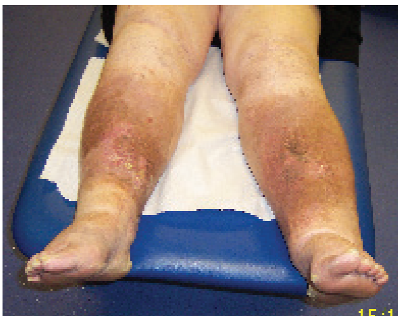
Figure 4. Lymphovenous oedema, suitable for treatment with FarrowWrap