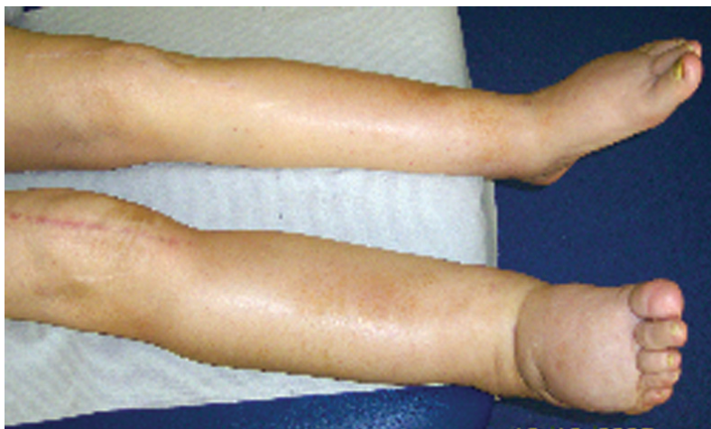
Figure 3. Dependency oedema can be suitable for treatment with FarrowWrap LITE